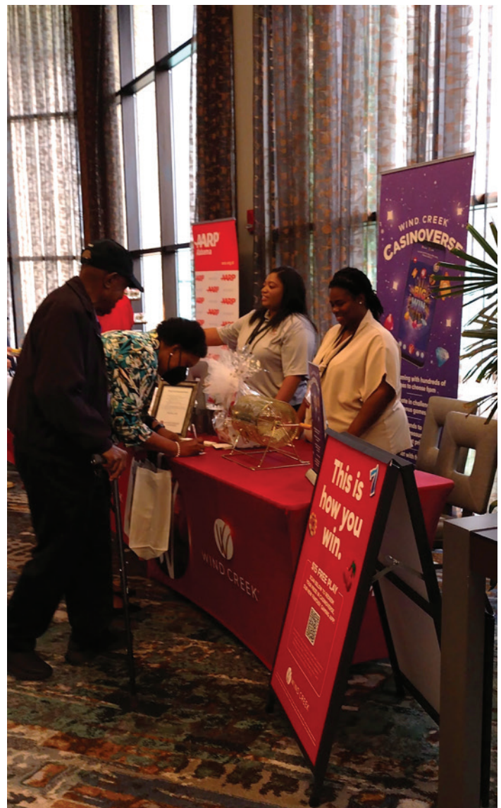
Wind Creek joined exhibitors for our Benefits Fair Breakfast