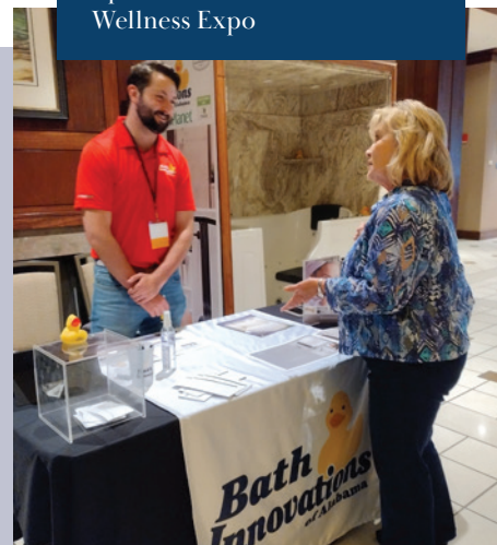
Bath Innovations along with fourteen other businesses and service providers shared valuable information and tips with attendees at the Wellness Expo