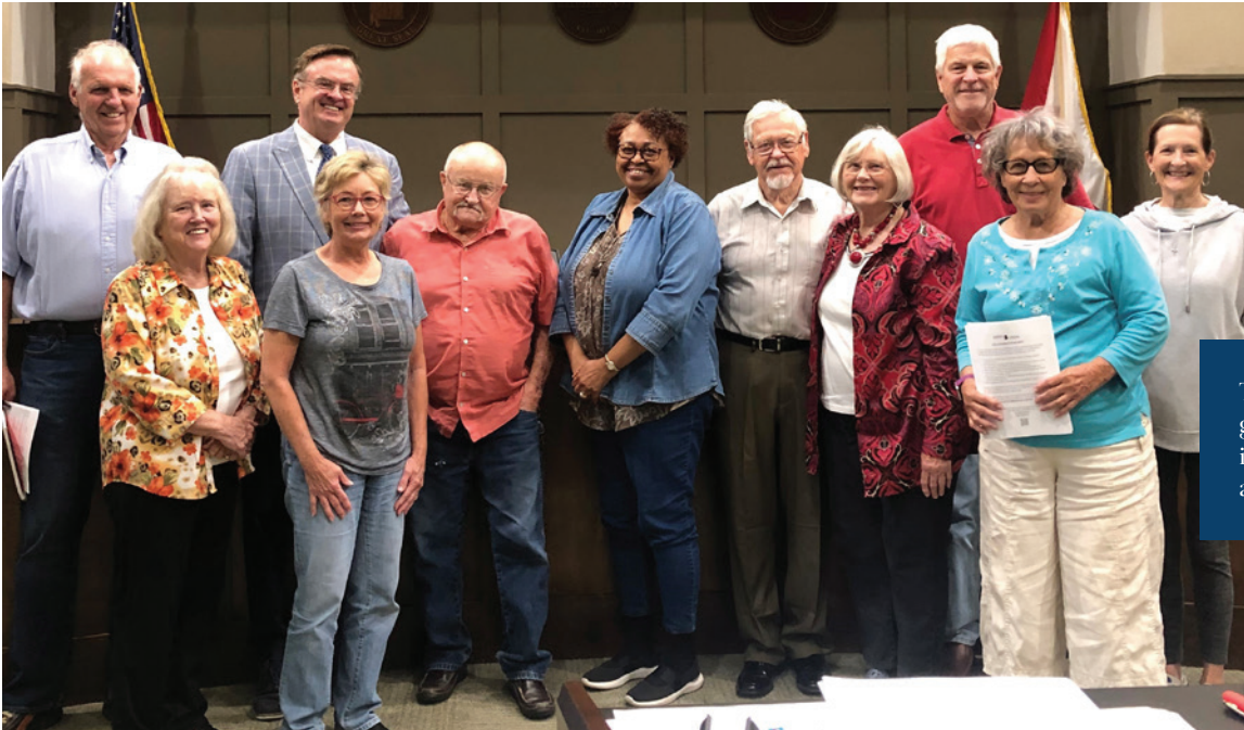
The members in Alabaster gathered to get the latest information about benefits and insurance.